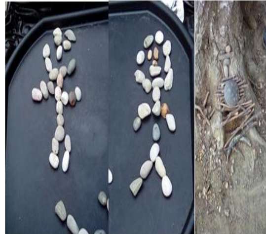
We have enjoyed taking our learning outside this half-term. We have followed our own enquiries and interests. Some of us made Stone age people out of stones. We were very proud when we made our own ant home.