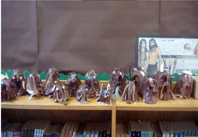
We followed instructions to make Woolly Mammoths. We think they look really cute!