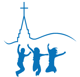
St. Michael's CE (VA) Junior School